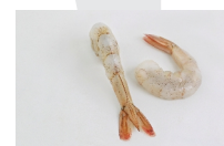
Peeled & deveined, tail on