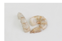
Peeled pulled vein