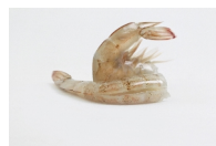
Headless easy peeled (Ezpeel)